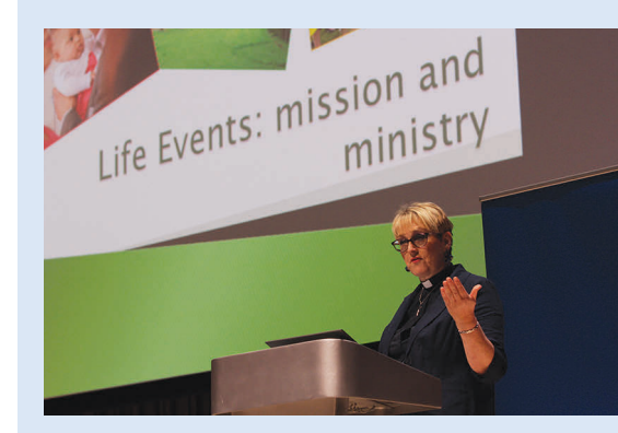
To find out more about the resources on offer, see: ChurchsupportHub.org and churchprinthub.org

<sup>11</sup>I haven't come to you with a brand new idea. This is something we already do – let's make sure we do it as well as possible.<sup>77</sup>