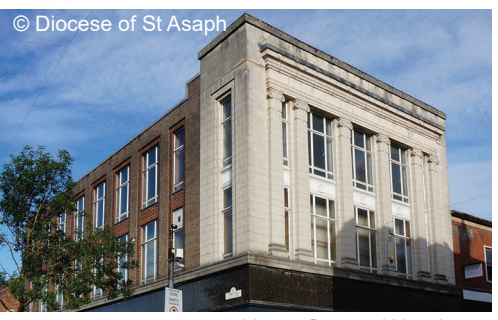
1 Hope Street, Wrexham